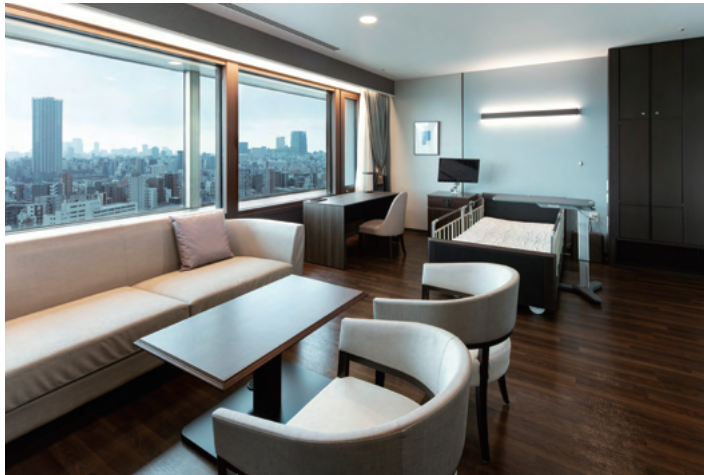
Grand Executive Room