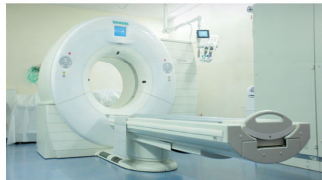
We are equipped with the latest medical devices including MRI, CT, and PET.